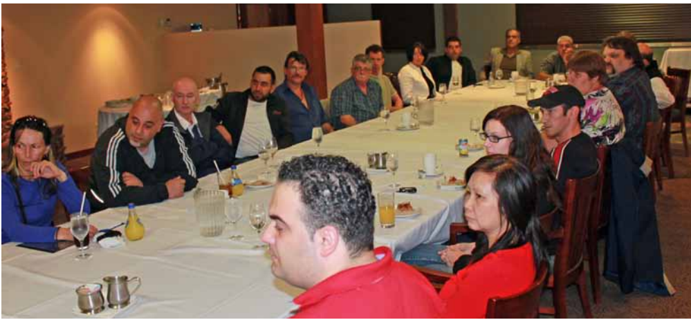
Executive Board and Steering Committee members in session