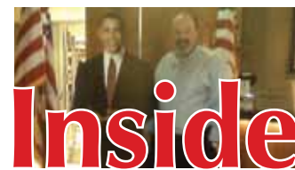
Guess who went to Washington?

Please be assured that individual members confidentiality is very important and we want all members to know your individual responses will not be given to the Union by Viewpoints Research.