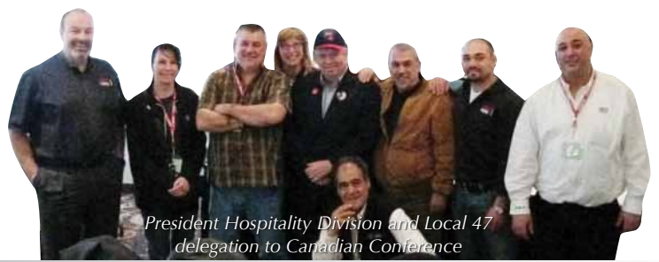
President Hospitality Division and Local 47 delegation to Canadian Conference